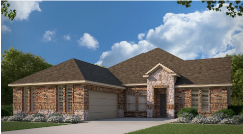
ELEVATION A – STONE