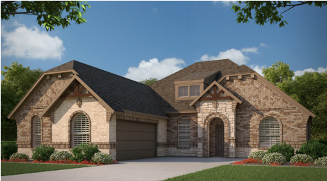
ELEVATION C – STONE

352 Pasture Drive, Midlothian, TX 76065 • (469) 609-1652