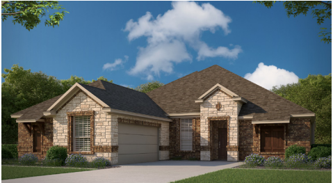
ELEVATION B – STONE