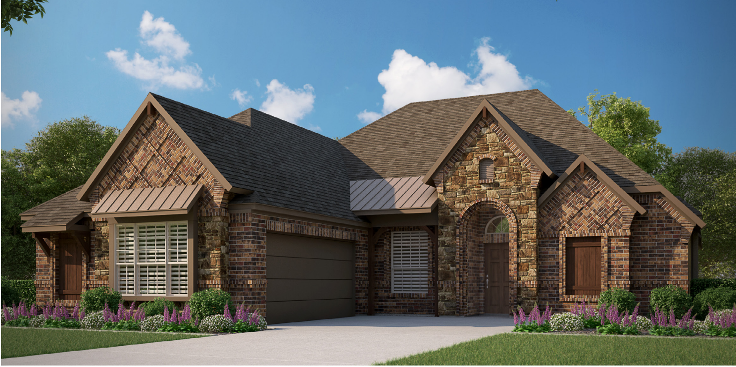
ELEVATION D – STONE

2,404 Square Feet • 3 Bedrooms • 2 Baths • 2-Car Garage