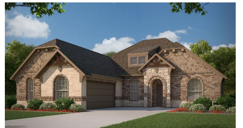
ELEVATION C - STONE

3176 Ferry Boat Lane, Granbury, TX 76049 • (817) 768-5196