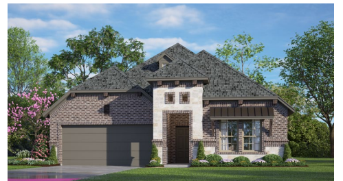
ELEVATION C - STONE

12529 Yellowstone Street, Godley, TX 76044 • (817) 438-2772