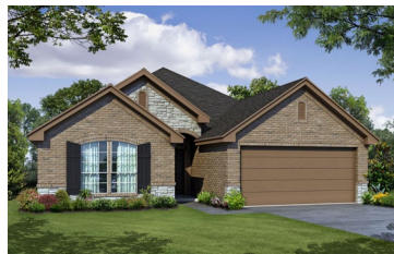
ELEVATION B - STONE