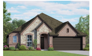
ELEVATION D - STONE