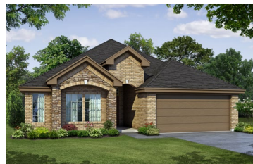
ELEVATION C - STONE

902 Misty Lane, Cleburne, TX 76033 • (817) 854-2229