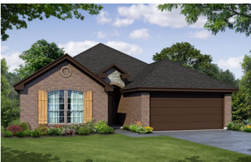
ELEVATION A - STONE