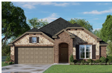
ELEVATION C - STONE

902 Misty Lane, Cleburne, TX 76033 • (817) 854-2229