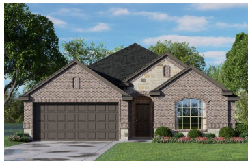
ELEVATION B - STONE