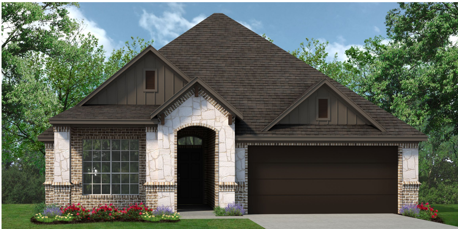
ELEVATION C - STONE

1,638 Square Feet • 3 Bedrooms • 2 Baths • 2-Car Garage