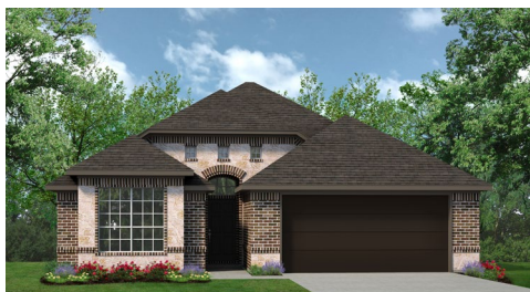
ELEVATION A - STONE