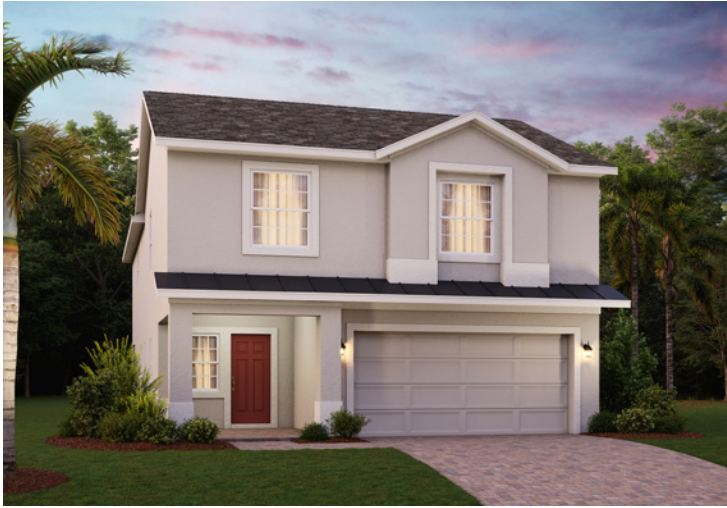
ELEVATION 3 - STUCCO