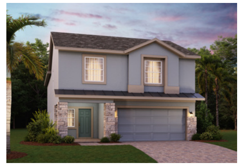
ELEVATION 3 - STONE

Renderings shown are examples. See sales office for range of finishes and configurations for the homes in this community.