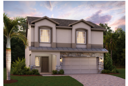
ELEVATION 2 - STONE