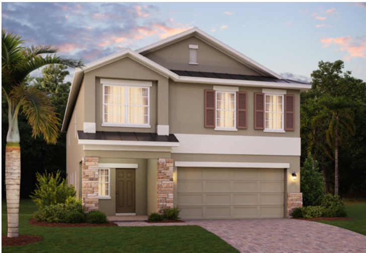
ELEVATION 4 - STONE