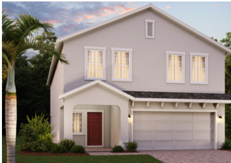
ELEVATION 1 - STUCCO