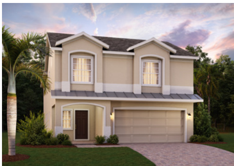
ELEVATION 2 - STUCCO