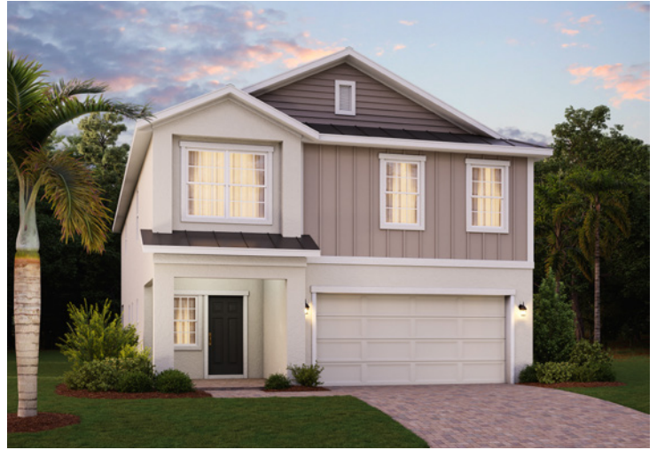
ELEVATION 4 - CLADDING