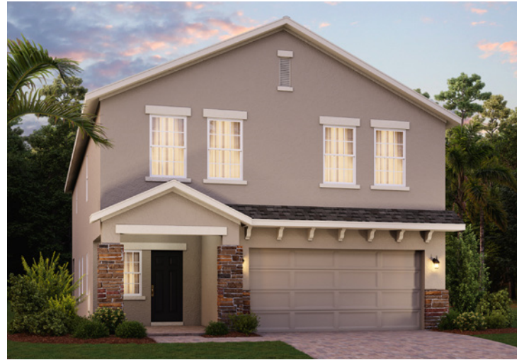
ELEVATION 1 - STONE