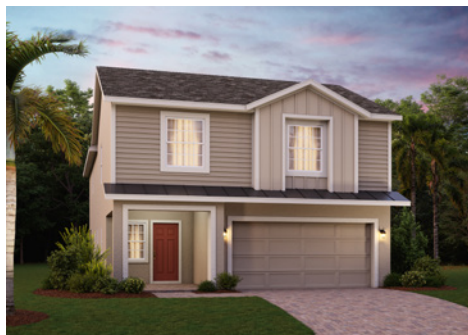
ELEVATION 3 - CLADDING