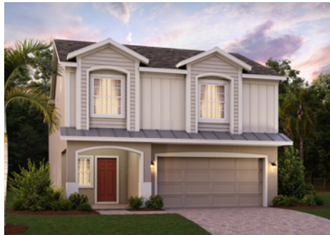
ELEVATION 2 - CLADDING