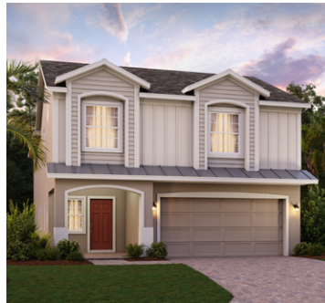
ELEVATION 2 - HARDIE