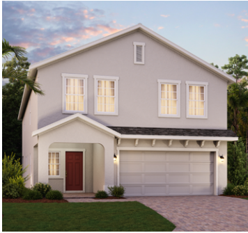
ELEVATION 1 - STUCCO

2,903 Square Feet • 4 Bedrooms • 2.5 Baths • 2-Car Garage