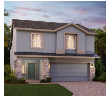
ELEVATION 3 - STONE