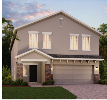
ELEVATION 1 - STONE