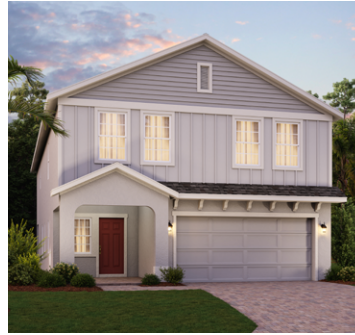
ELEVATION 1 - HARDIE