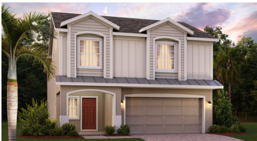
Elevation 2 - Hardie