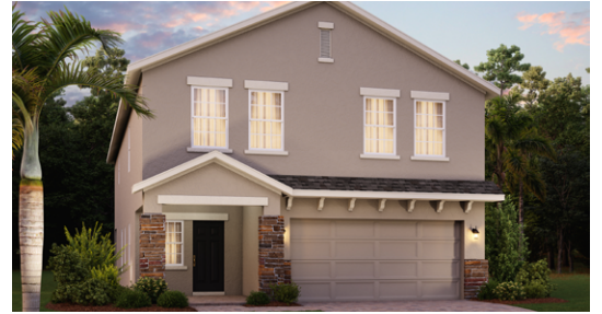
Elevation 1 - Stone