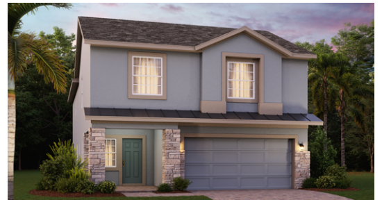
Elevation 3 - Stone