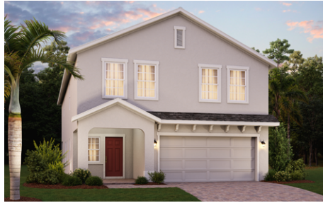
Elevation 1 - Stucco