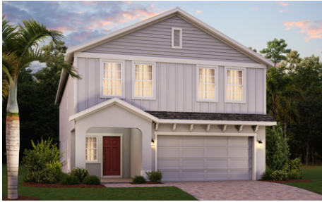
Elevation 1 - Hardie

2,903 Square Feet • 4 Bedrooms • 2.5 Baths • 2-Car Garage