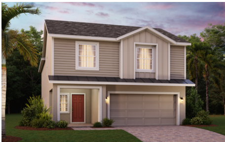
Elevation 3 - Hardie