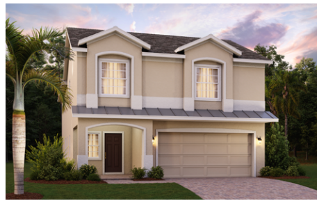
Elevation 2 - Stucco