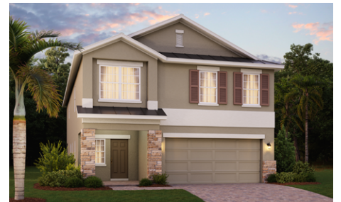
Elevation 4 - Stone

7504 Catania Loop, Clermont, FL 34714 • (407) 972-0445