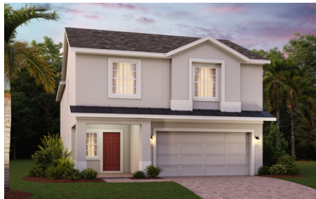
Elevation 3 - Stucco