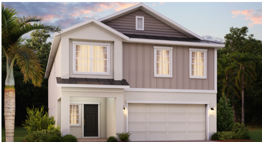
Elevation 4 - Hardie