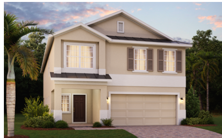
Elevation 4 - Stucco