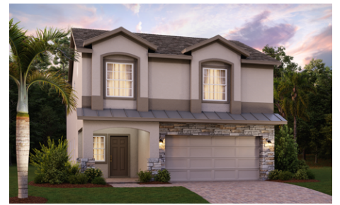
Elevation 2 - Stone