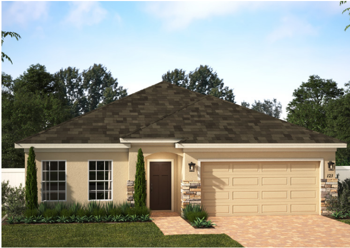
ELEVATION 1 - STONE FINISH