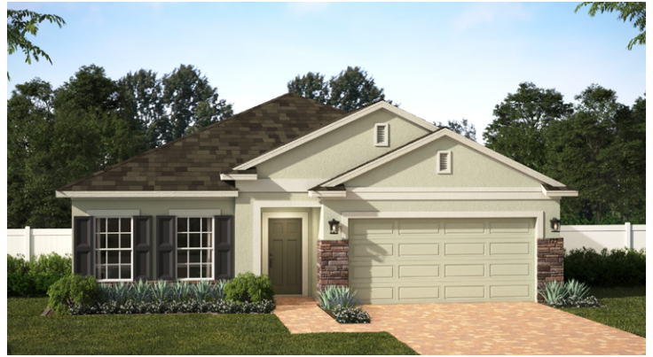
ELEVATION 2 - STONE