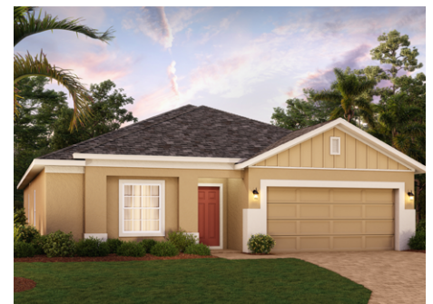
ELEVATION 3 - HARDIE

1578 Sky Lakes Drive, St. Cloud, FL 34767 • (407) 392-2603