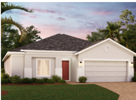
ELEVATION 3 - STUCCO