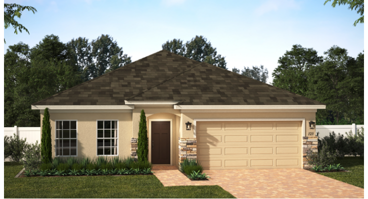
ELEVATION 1 - STONE