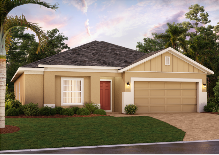
Elevation 3 - Hardie

1,819 Square Feet • 4 Bedrooms • 2 Baths • 2-Car Garage