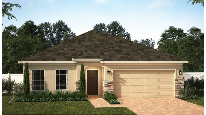
ELEVATION 1 - STONE