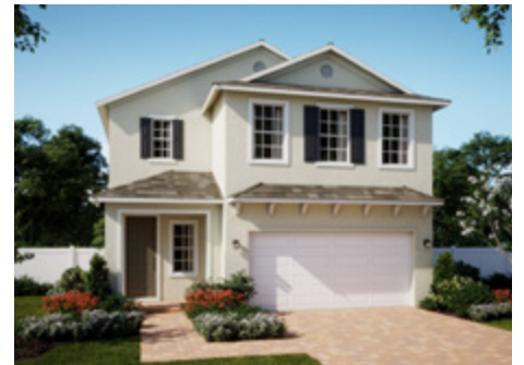
Elevation 3 - Stucco