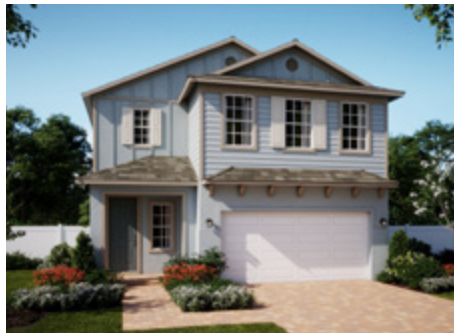
Elevation 3 - Hardie

7504 Catania Loop, Clermont, FL 34714 • (407) 972-0445