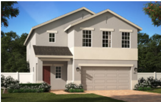
Elevation 2 - Stucco