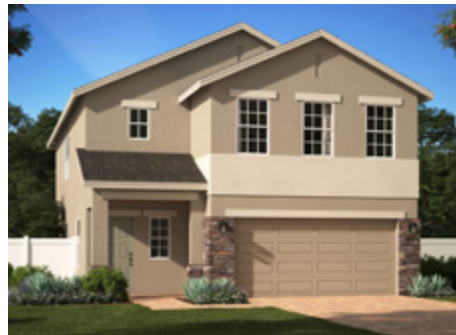
Elevation 2 - Stone