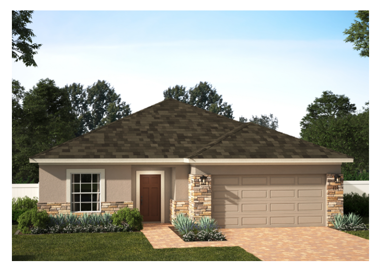
ELEVATION 1 - STONE