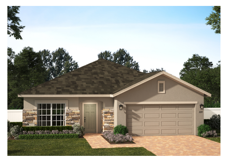
ELEVATION 2 - STONE