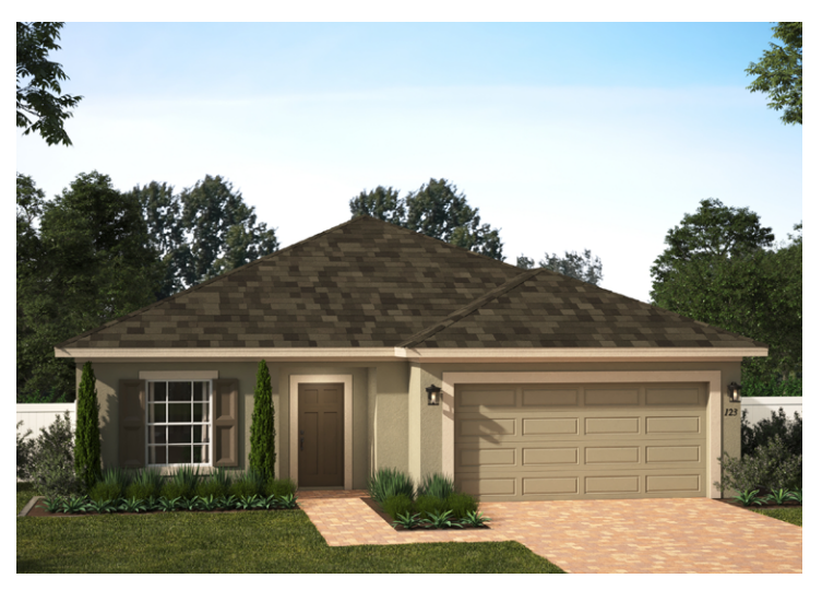
ELEVATION 1 - STUCCO

2,105 Square Feet • 4 Bedrooms • 3 Baths • 2-Car Garage