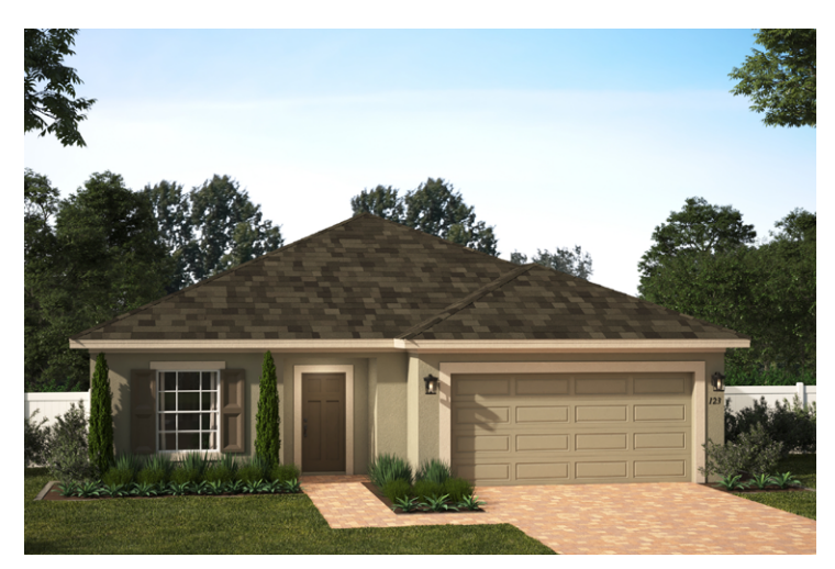
Elevation 1 - Stucco