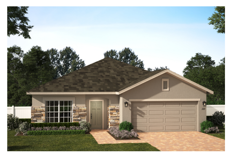
Elevation 2 - Stone