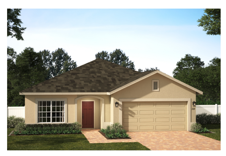
Elevation 2 - Stucco