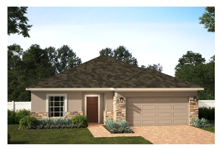
Elevation 1 - Stone

2,105 Square Feet • 4 Bedrooms • 3 Baths • 2-Car Garage