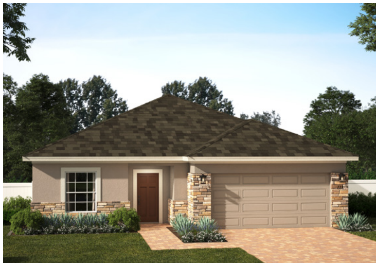
ELEVATION 1 - STONE