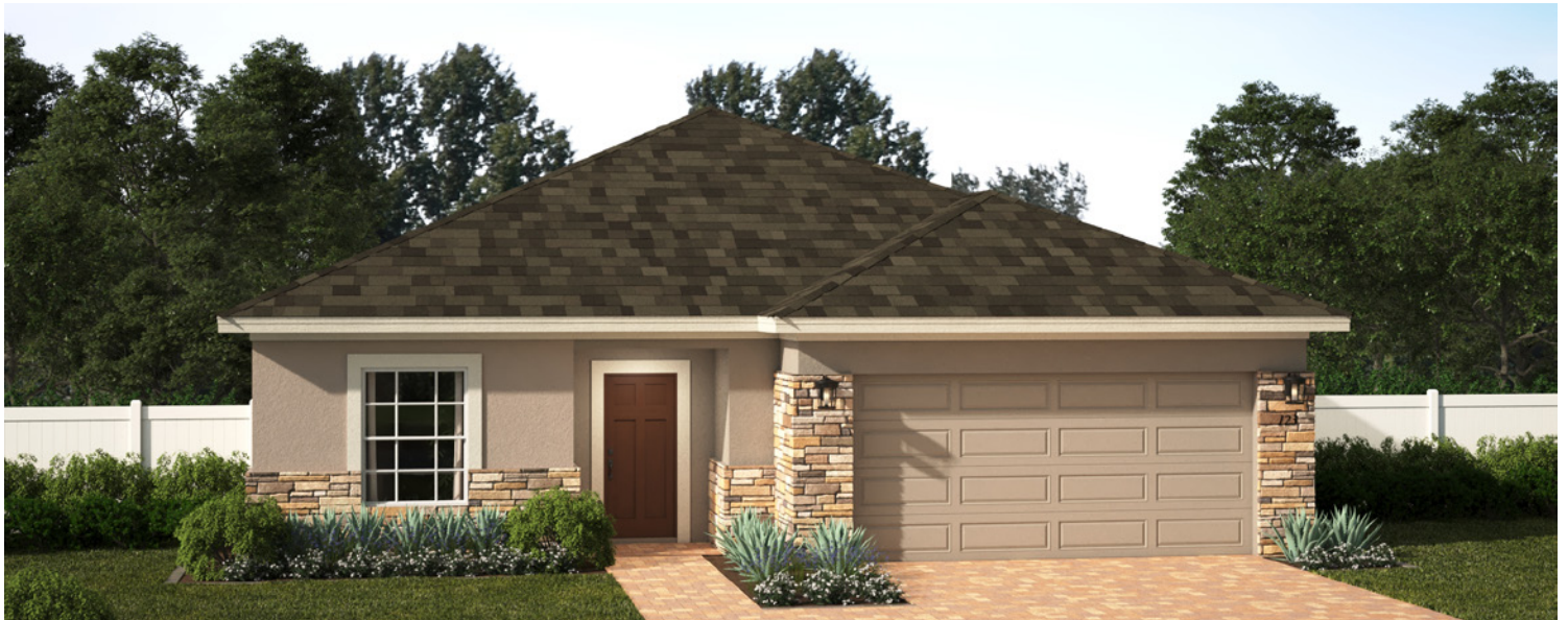
ELEVATION 1 - STONE