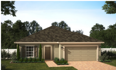
ELEVATION 1 - STUCCO