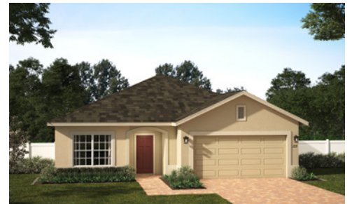
ELEVATION 2 - STUCCO

Renderings shown examples - see sales office for range of finishes and configurations for the homes in this community.