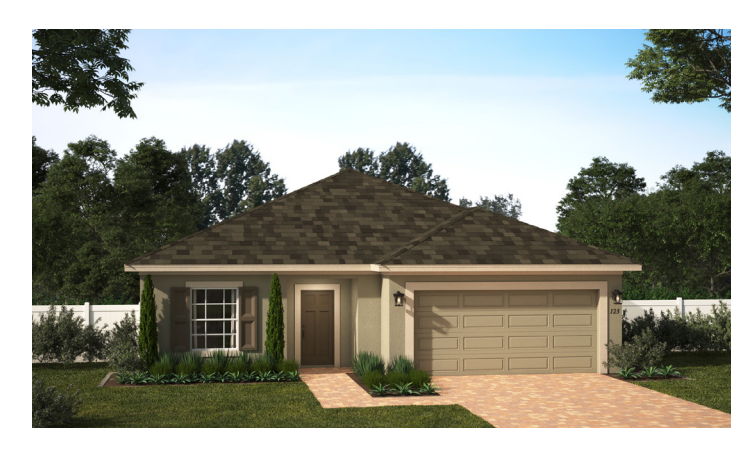
ELEVATION 1 - STUCCO

2,105 Square Feet • 4 Bedrooms • 3 Baths • 2-Car Garage