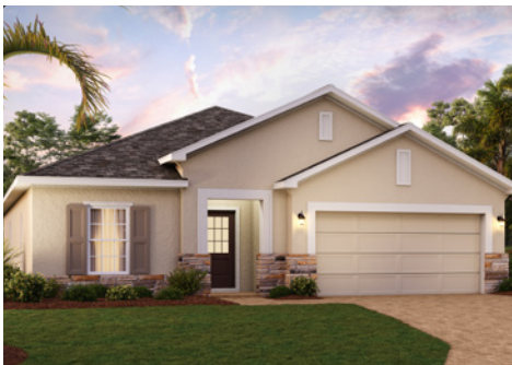
ELEVATION 3 - STONE