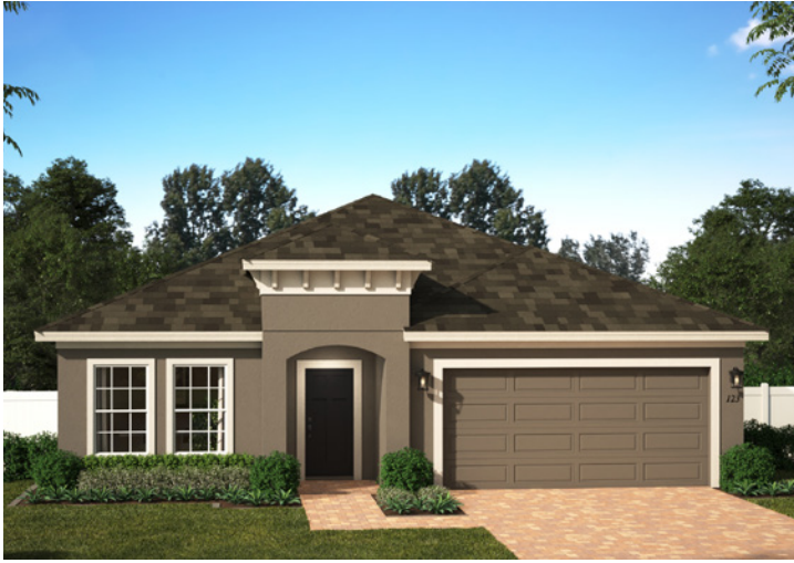
ELEVATION 1 - STUCCO

1,979 Square Feet • 4 Bedrooms • 2 Baths • 2-Car Garage