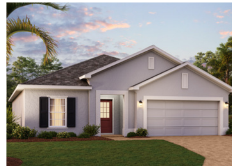
ELEVATION 3 - STUCCO

123 Green Branch Blvd., Groveland, FL 34736 • (407) 315-1122