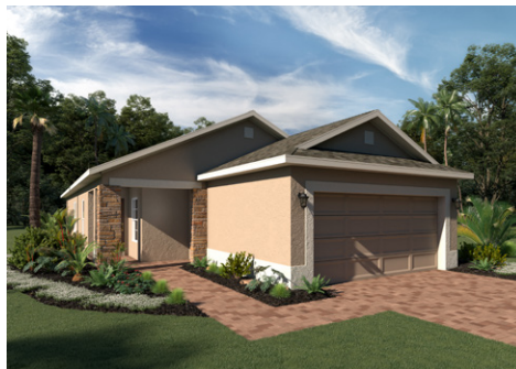
ELEVATION 2 - STONE FINISH