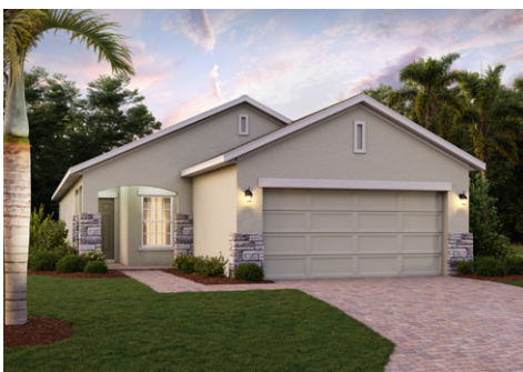
ELEVATION 3 - STONE FINISH