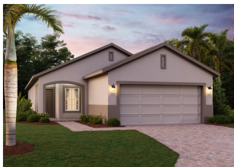
ELEVATION 3 - STUCCO FINISH

Renderings shown are examples. See sales office for range of finishes and configurations for the homes in this community.