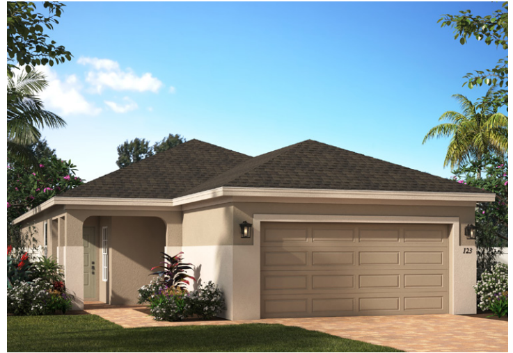
ELEVATION 1 - STUCCO FINISH