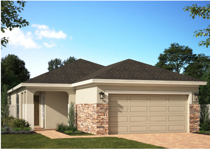
ELEVATION 1 - STONE FINISH