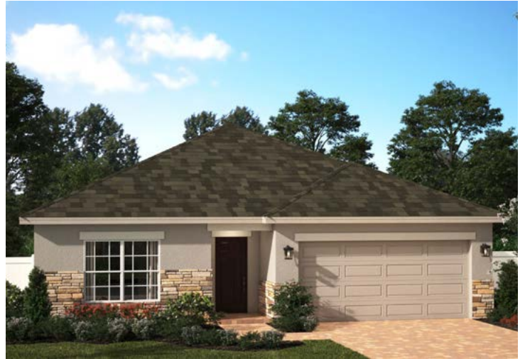
ELEVATION 1 - STONE