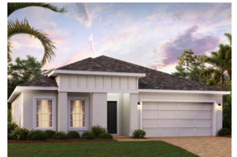
ELEVATION 3 - HARDIE