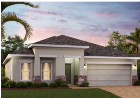
ELEVATION 3 - STONE