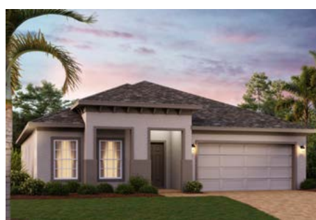
ELEVATION 3 - STUCCO

3529 Yarian Drive, Haines City, FL 33844 • (407) 871-3360