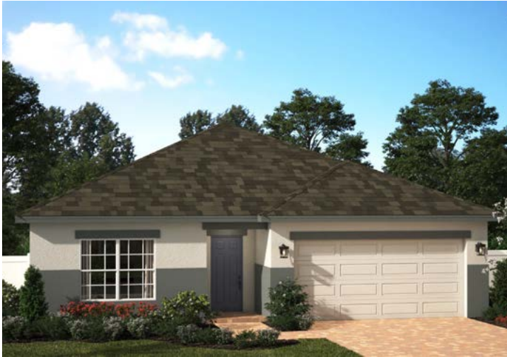
ELEVATION 1 - STUCCO

1,773 Square Feet • 4 Bedrooms • 2 Baths • 2-Car Garage