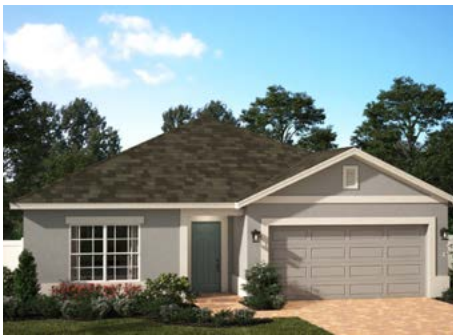
ELEVATION 2 - STUCCO