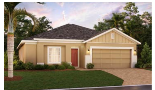
ELEVATION 3 - HARDIE

1111 Happy Forest Loop, DeLand, Florida 32720 • (407) 392-2606