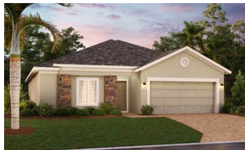
ELEVATION 3 - STONE