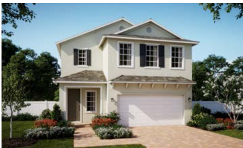
ELEVATION 3 - STUCCO