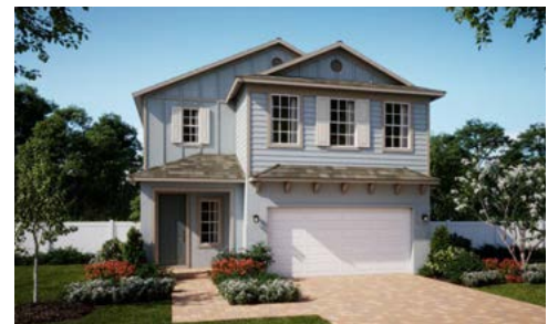
ELEVATION 3 - HARDIE

1111 Happy Forest Loop, DeLand, Florida 32720 • (407) 392-2606