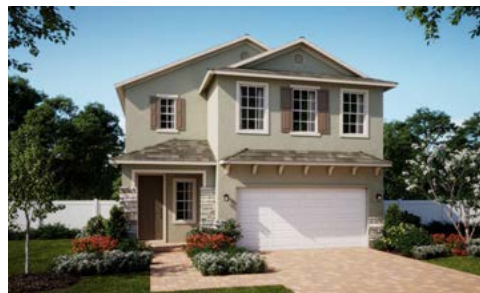
ELEVATION 3 - STONE