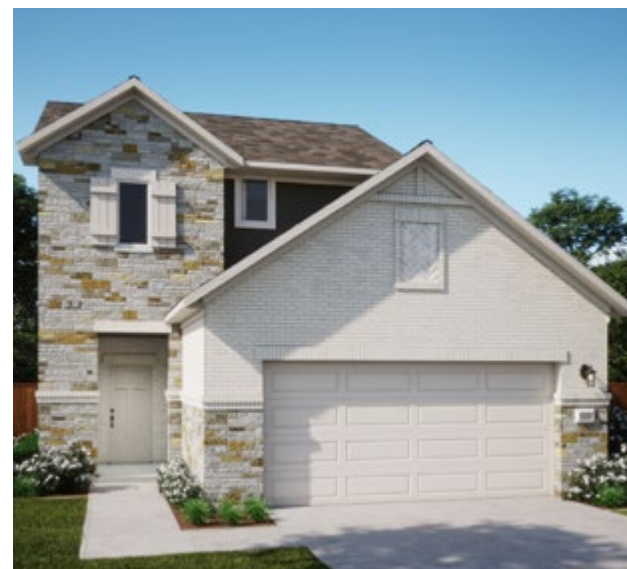
ELEVATION B - STONE