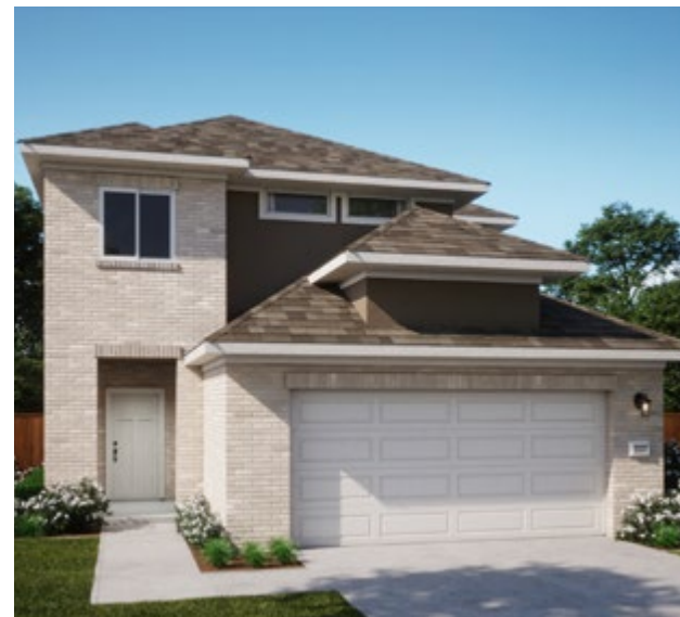
ELEVATION A - STUCCO