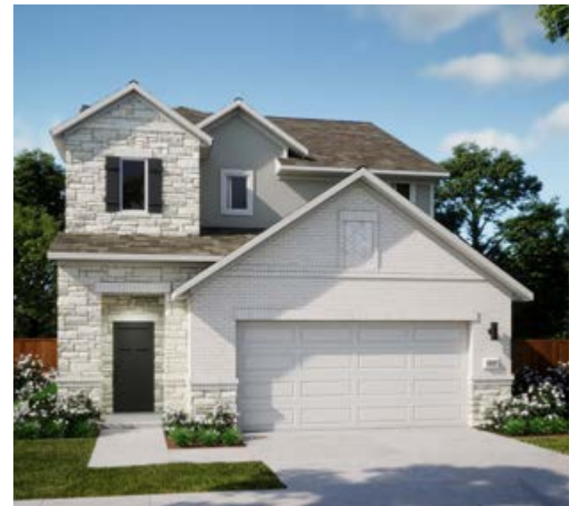
ELEVATION B - STONE