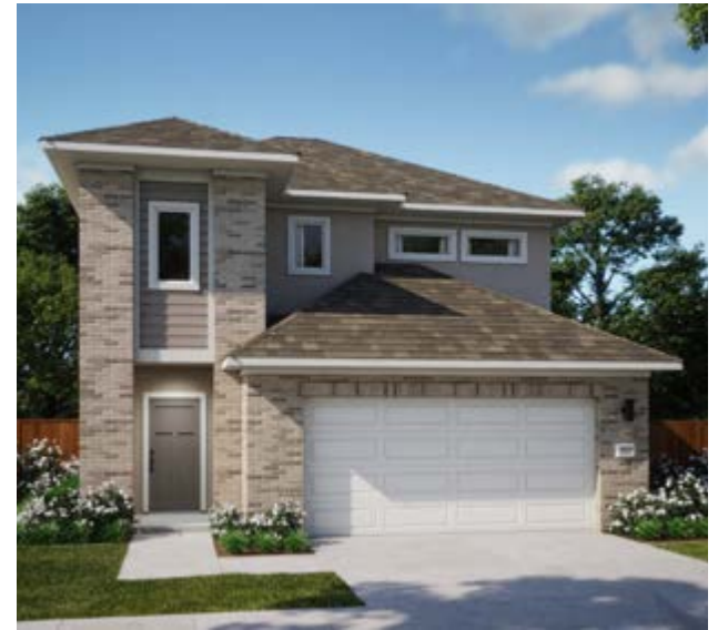
ELEVATION A - STUCCO