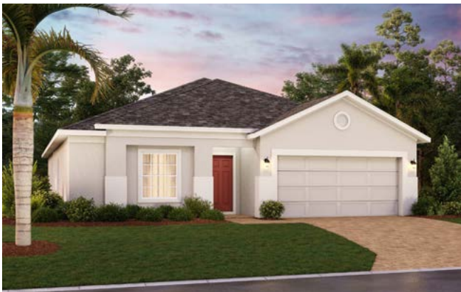
Elevation 3 – Stucco