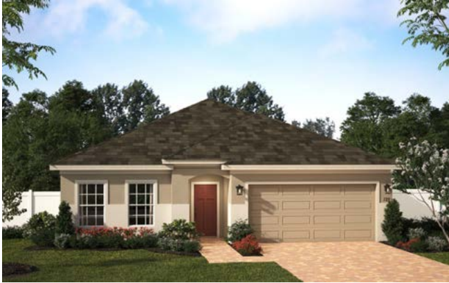
Elevation 1 – Stucco