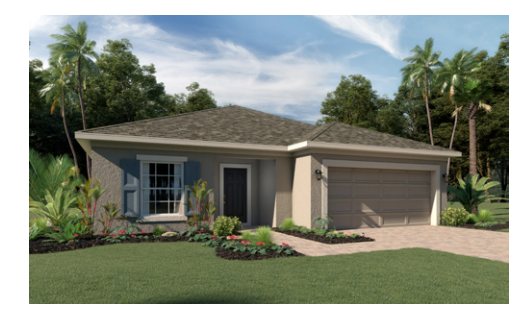
ELEVATION 1 - STUCCO