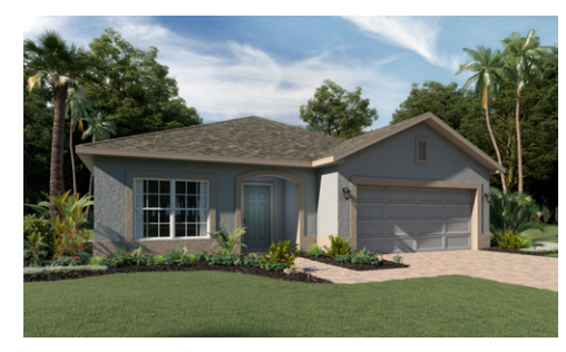
ELEVATION 2 - STUCCO

Renderings shown are examples - see sales office for range of finishes and configurations for the homes in this community.