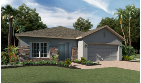
ELEVATION 2 - STONE