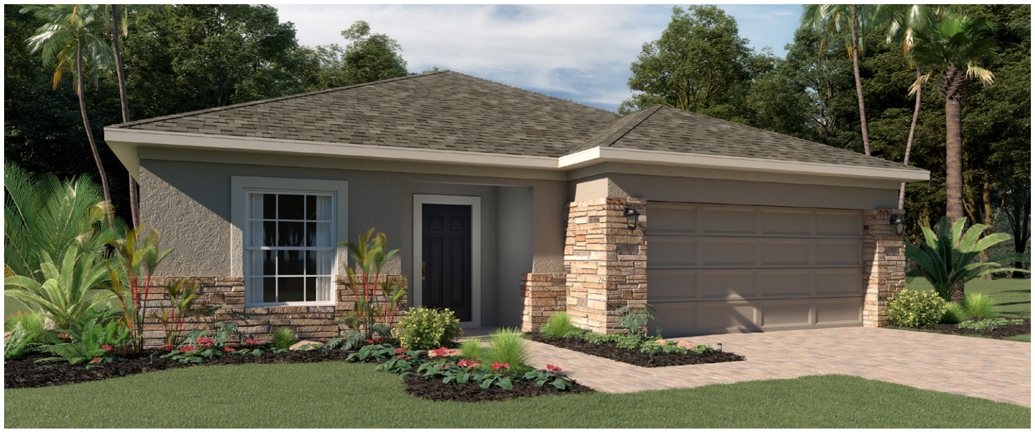
ELEVATION 1 - STONE