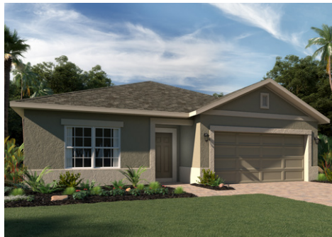
ELEVATION 2 - STUCCO