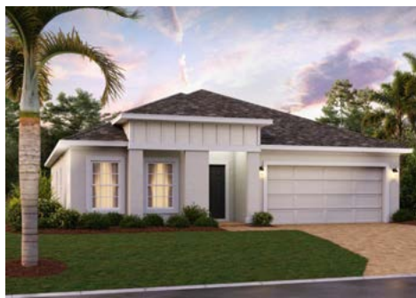
ELEVATION 3 - HARDIE

Renderings shown are examples - see sales office for range of finishes and configurations for the homes in this community.