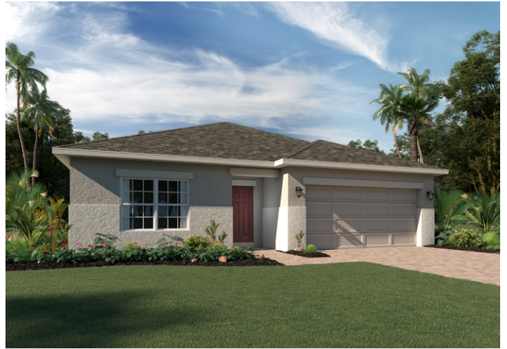
ELEVATION 1 - STUCCO