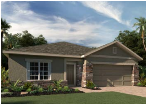
ELEVATION 2 - STONE