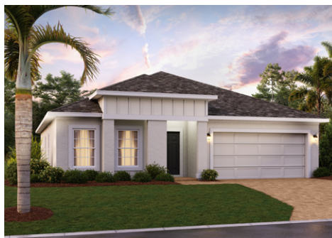
ELEVATION 3 - HARDIE

Renderings shown are examples - see sales office for range of finishes and configurations for the homes in this community.