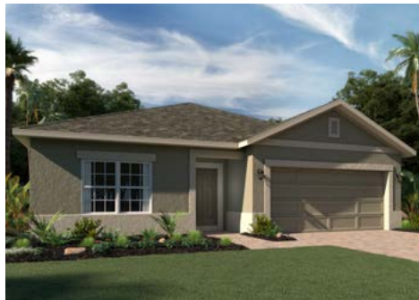
ELEVATION 2 - STUCCO