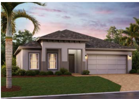
ELEVATION 3 - STUCCO