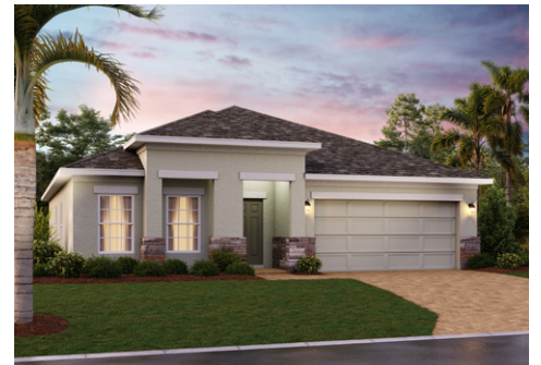
ELEVATION 3 - STONE