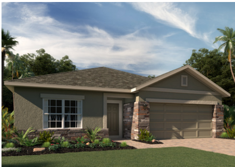
ELEVATION 2 - STONE