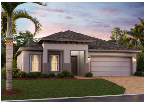
ELEVATION 3 - STUCCO