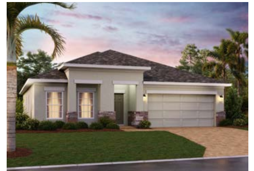
ELEVATION 3 - STONE