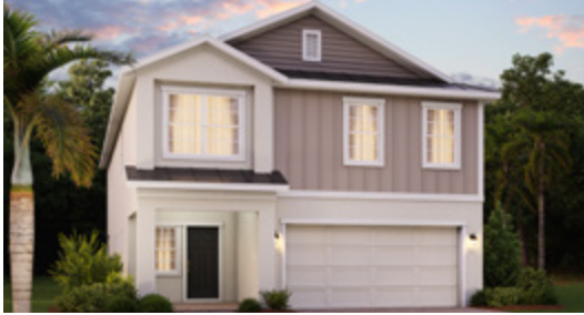
Elevation 4 – Hardie

2,903 Square Feet • 4 Bedrooms • 2.5 Baths • 2-Car Garage