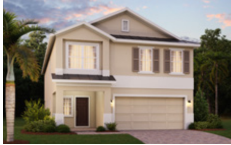
Elevation 4 – Stucco