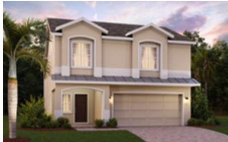
Elevation 2 – Stucco