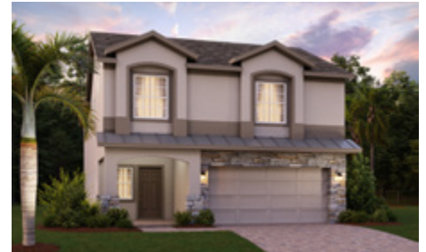
Elevation 2 – Stone