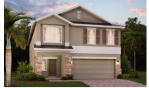
Elevation 4 – Stone