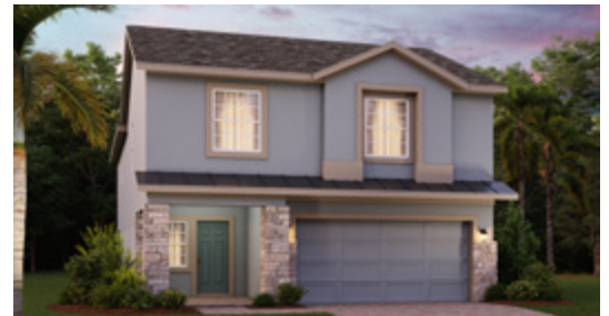
Elevation 3 – Stone

7504 Catania Loop, Clermont, FL 34714 • (407) 972-0445