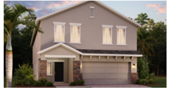
Elevation 1 – Stone