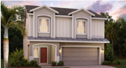
Elevation 2 – Hardie