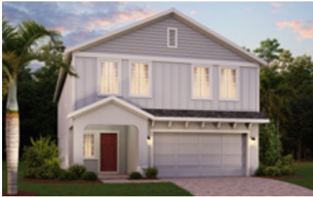
Elevation 1 – Hardie