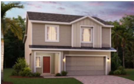
Elevation 3 – Hardie