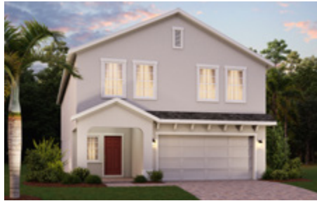
Elevation 1 – Stucco