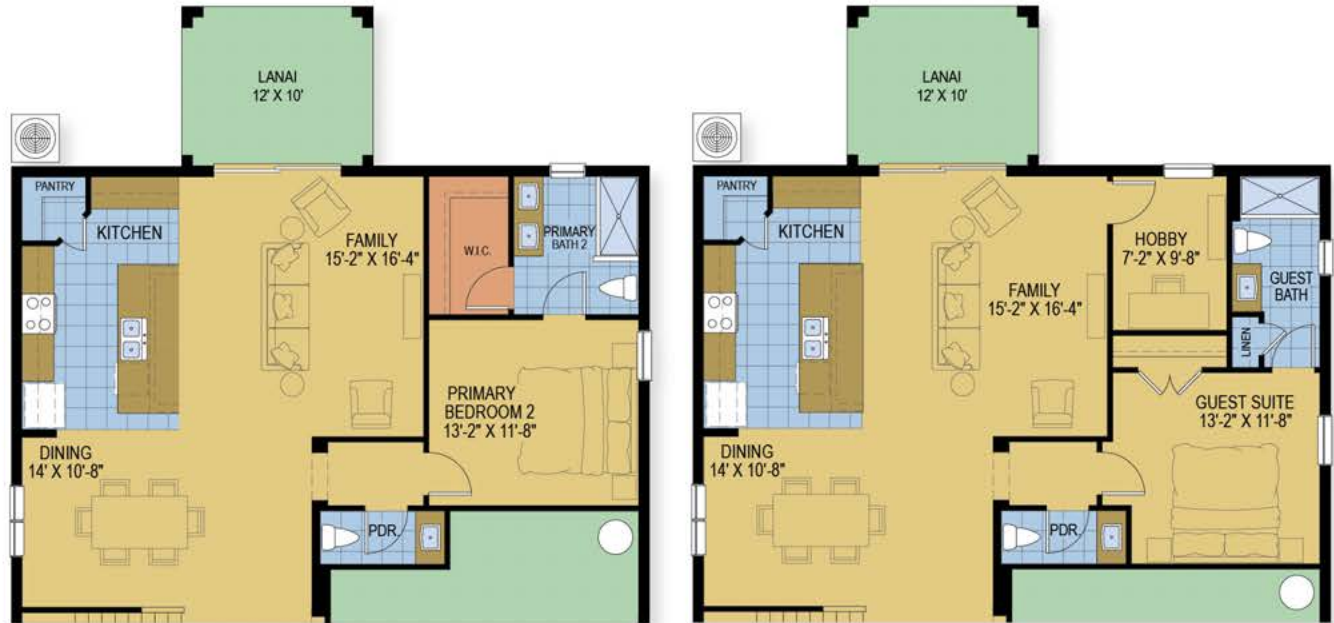
OPTIONAL SECOND PRIMARY BEDROOM (DOES NOT INCLUDE DTV PROMPT® DIGITAL SHOWER & FRAMELESS, HEAVY-GLASS ENCLOSURE)

2,737 Square Feet • 4 – 6 Bedrooms • 2.5 – 3.5 Baths • 3-Car Garage