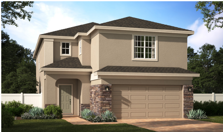
ELEVATION 1 - STONE