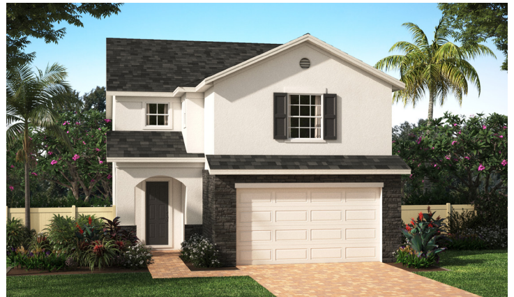
ELEVATION 3 - STONE

1262 Canfield Cir. SE, Palm Bay, FL 32909 • (321) 336-5486