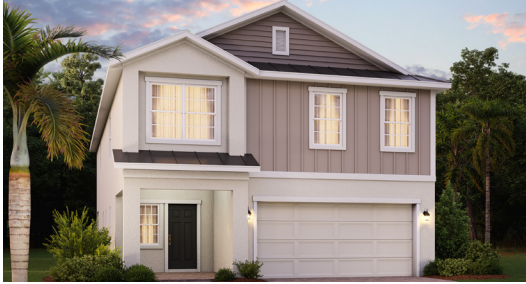
ELEVATION 4 - HARDIE FINISH

2,903 Square Feet • 4 Bedrooms • 2.5 Baths • 2-Car Garage