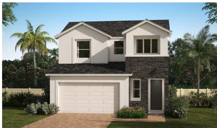
MODERN EUROPEAN ELEVATION