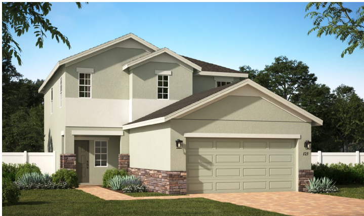
ELEVATION 2 - STONE