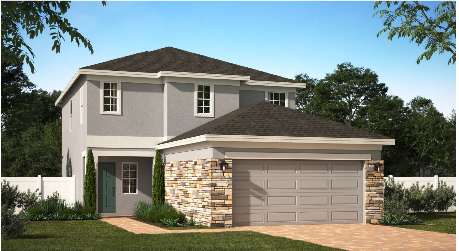
ELEVATION 1 - STONE

1,968 Square Feet • 4 Bedrooms • 2.5 Baths • 2-Car Garage