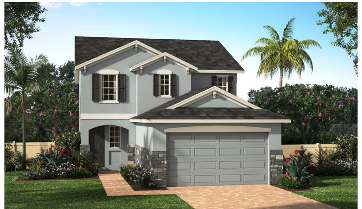
ELEVATION 3 - STONE

1262 Canfield Cir. SE, Palm Bay, FL 32909 • (321) 378-2334