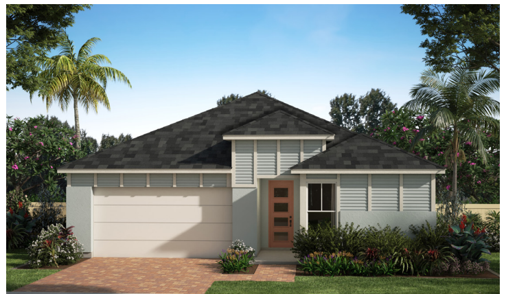
WEST INDIES ELEVATION

3466 Rixford Way SE, Palm Bay, FL 32909 • (321) 346-9517