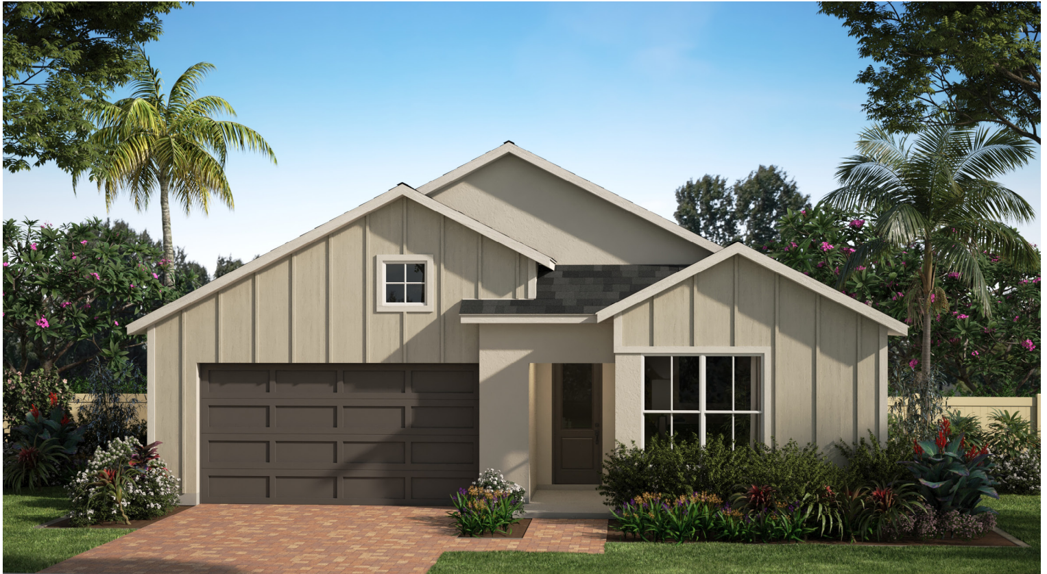
MODERN FARMHOUSE ELEVATION

2,365 Square Feet • 4 Bedrooms • 3 Baths • 2-Car Garage