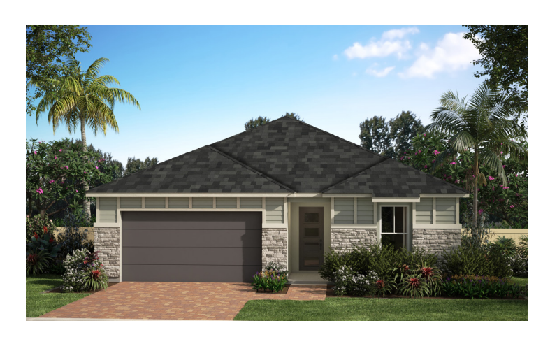
WEST INDIES ELEVATION