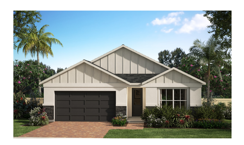
MODERN FARMHOUSE ELEVATION