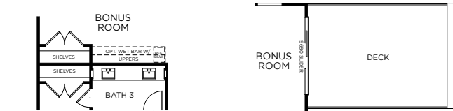
OPTIONAL STORAGE AT BONUS ROOM