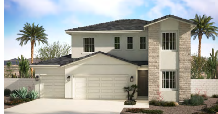
MODERN RANCH ELEVATION Shown with optional stone