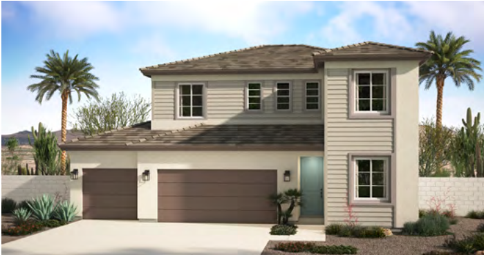
DESERT PRAIRIE ELEVATION