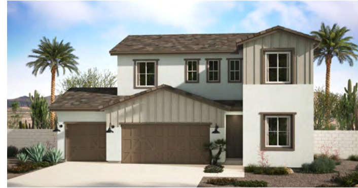
WESTERN FARMHOUSE ELEVATION