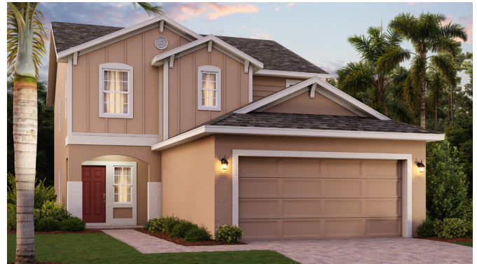
ELEVATION 3 (SHOWN WITH OPTIONAL CLADDING)