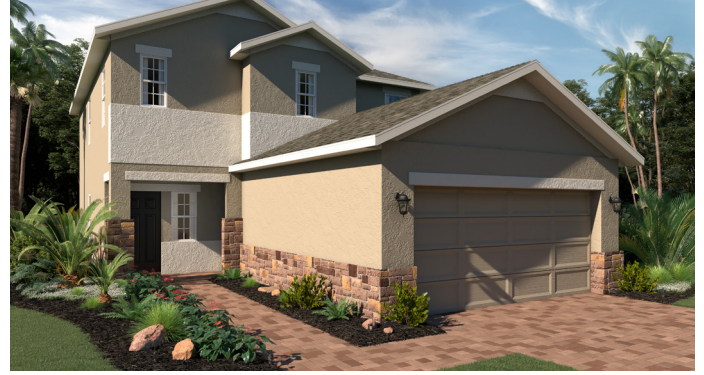
ELEVATION 2 (SHOWN WITH OPTIONAL STONE)