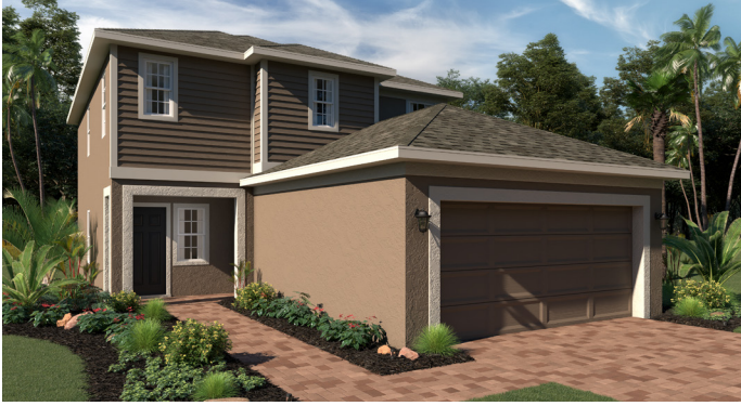
ELEVATION 1 (SHOWN WITH OPTIONAL CLADDING)

1,968 Square Feet • 4 Bedrooms • 2.5 Baths • 2-Car Garage