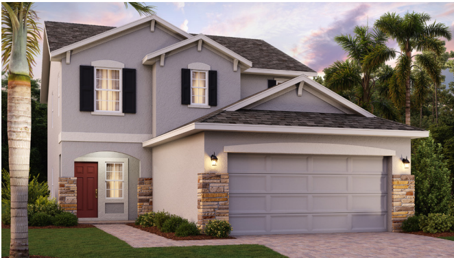
ELEVATION 3 (SHOWN WITH OPTIONAL STONE)