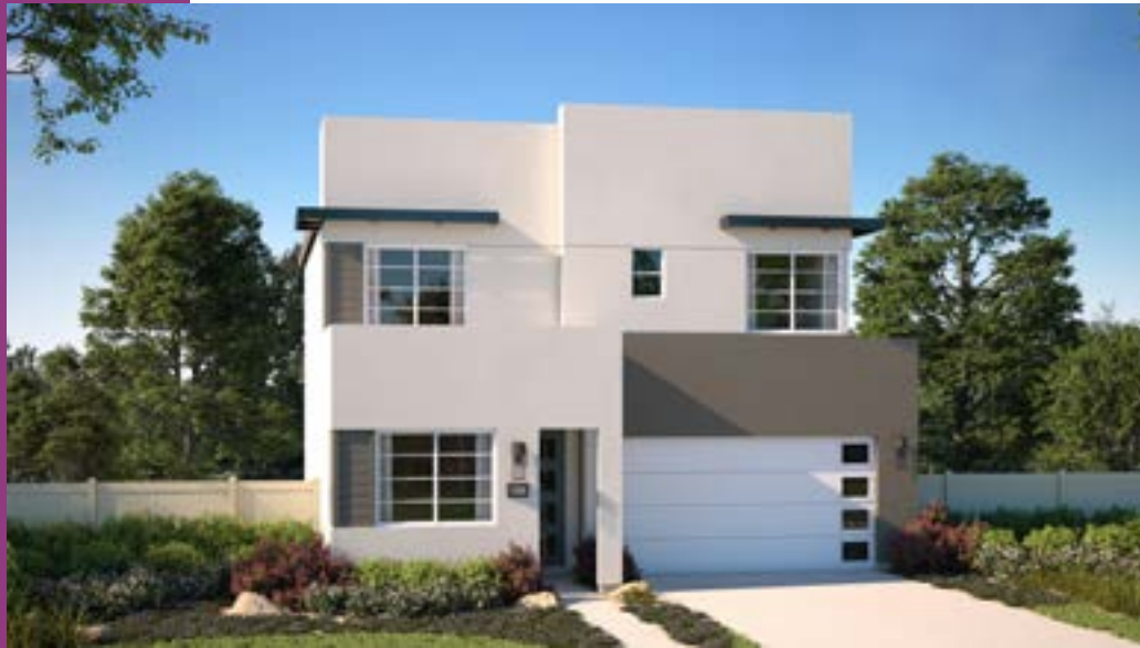
PLAN 2C CALIFORNIA MODERN