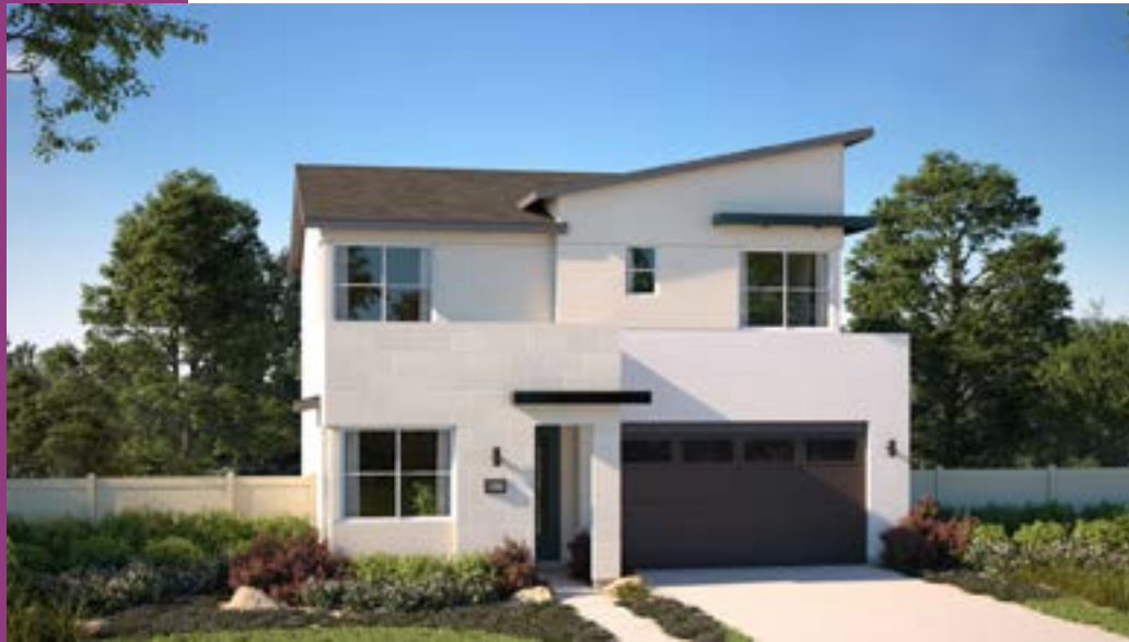
PLAN 2B MID-CENTURY MODERN