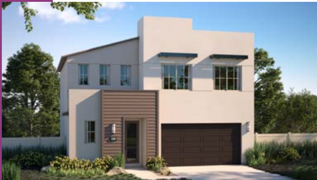
PLAN 1A MODERN SPANISH