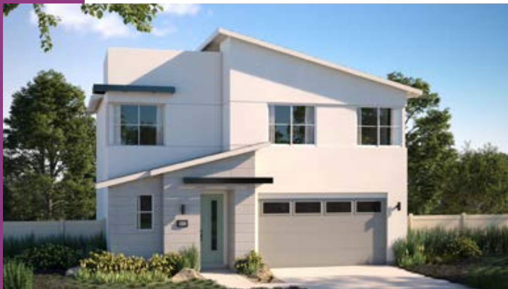
PLAN 1B MID-CENTURY MODERN