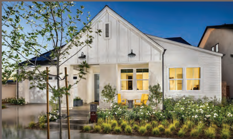
PLAN ONE C