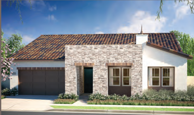
PLAN ONE A