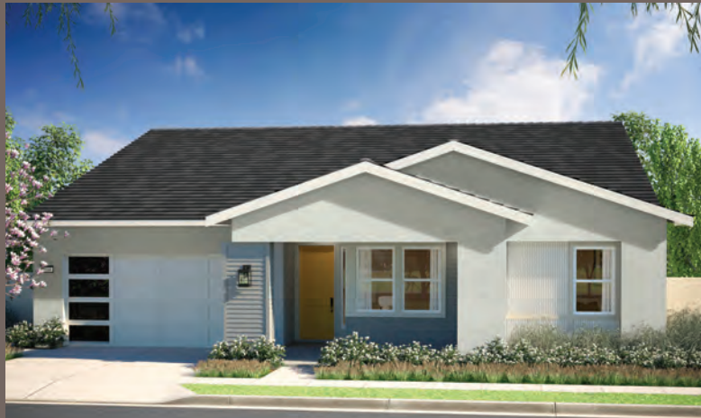
PLAN ONE B