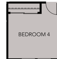
OPTIONAL BEDROOM 4